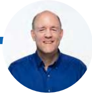
BY RICK WOOD EDITOR OF MF